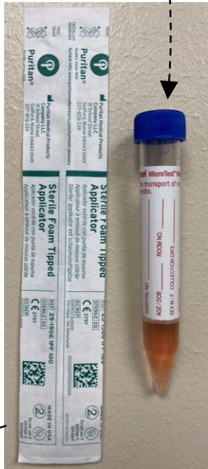
Nasal swab and transport media